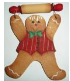
Merlene Ryan's Gingerbread Man with Rolling Pin