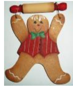
Merlene Ryan's Gingerbread Man with Rolling Pin